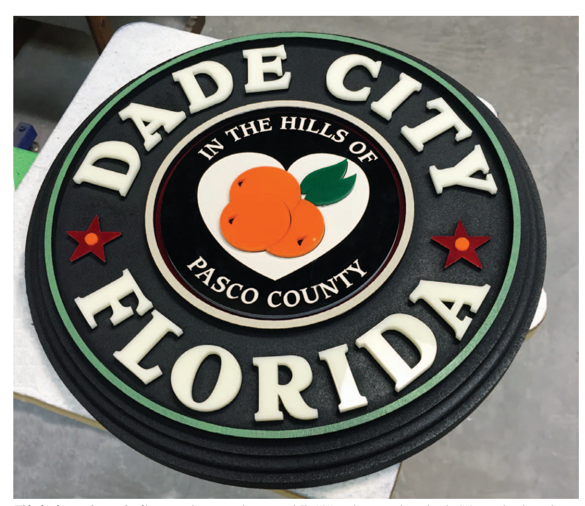
"This sign is a good example of how we use laser-cut acrylic on our work. The HDU panel was cut and carved on the CNC router, then the graphics are all laser cut from different colors of acrylic. I like that the acrylic will look good forever, and I really like how much production time we save."