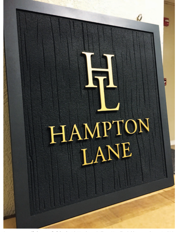
Laser-cut acrylic letters finished with Matthews Brilliant Metallic Gold on a 34-by-37-in.CNC router carved HDU panel.