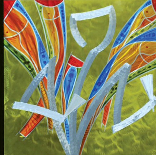
Above Photo: Art by Marcos; Cover Photos: DaNite Sign Company provided Grand View Theatre and Columbus Zoo and Aquarium; Western Neon provided The Ice-Burg